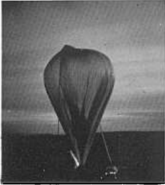
Launching of NRL balloon-borne gamma-ray experiment