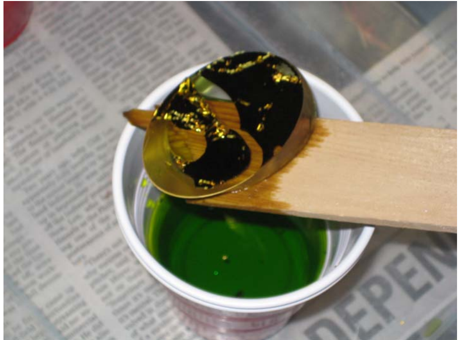
Photo: Partly-stripped mirror being held above a plastic container of Green River by a piece of wood. Note the gold flaking off.

OK, so I was able to remove most of the coating with either Green River or FeCl. And if I had been willing to wait for some period of days with the mirrors immersed, they might have removed everything, but I was too impatient.