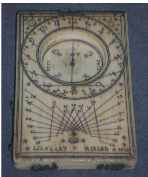
Figure 3 – Outer Lid of a Traveler timepiece; c. 1621.

After aligning the Traveler sundial with magnetic north and correcting for magnetic declination, the user used the shadow cast by the Sun on the string or the spot cast by the hole in the lid to determine the time on the scale marked on the base in the manner of sundials. Despite the small size of the unit and the user's likely errors in alignment, the instrument still gave times accurate to within an hour or so. The accuracy depended on the time of year, time of day, and the 2 axes leveling of the Traveler. And of course, if it were a cloudy day, the user was simply out of luck.