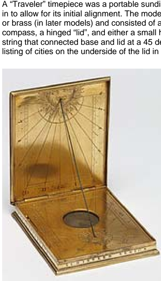
Figure 2 – Brass Portable Timepiece; c. 1650.

After aligning the Traveler sundial with magnetic north and correcting for magnetic declination, the user used the shadow cast by the Sun on the string or the spot cast by the hole in the lid to determine the time on the scale marked on the base in the manner of sundials. Despite the small size of the unit and the user's likely errors in alignment, the instrument still gave times accurate to within an hour or so. The accuracy depended on the time of year, time of day, and the 2 axes leveling of the Traveler. And of course, if it were a cloudy day, the user was simply out of luck.