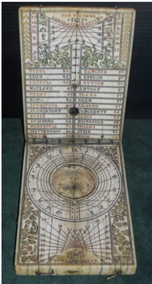
Figure 1 – Ivory Portable Timepiece; c. 1600.