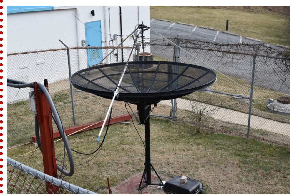
Radio Telescope at the University of Maryland Observatory.

One other advantage of radio telescopes over optical telescopes is that they can be used 24 hours a day. And cloudy days are no problem. Just as radio signals pass unhindered through dust and gas in space, they pass right through clouds.